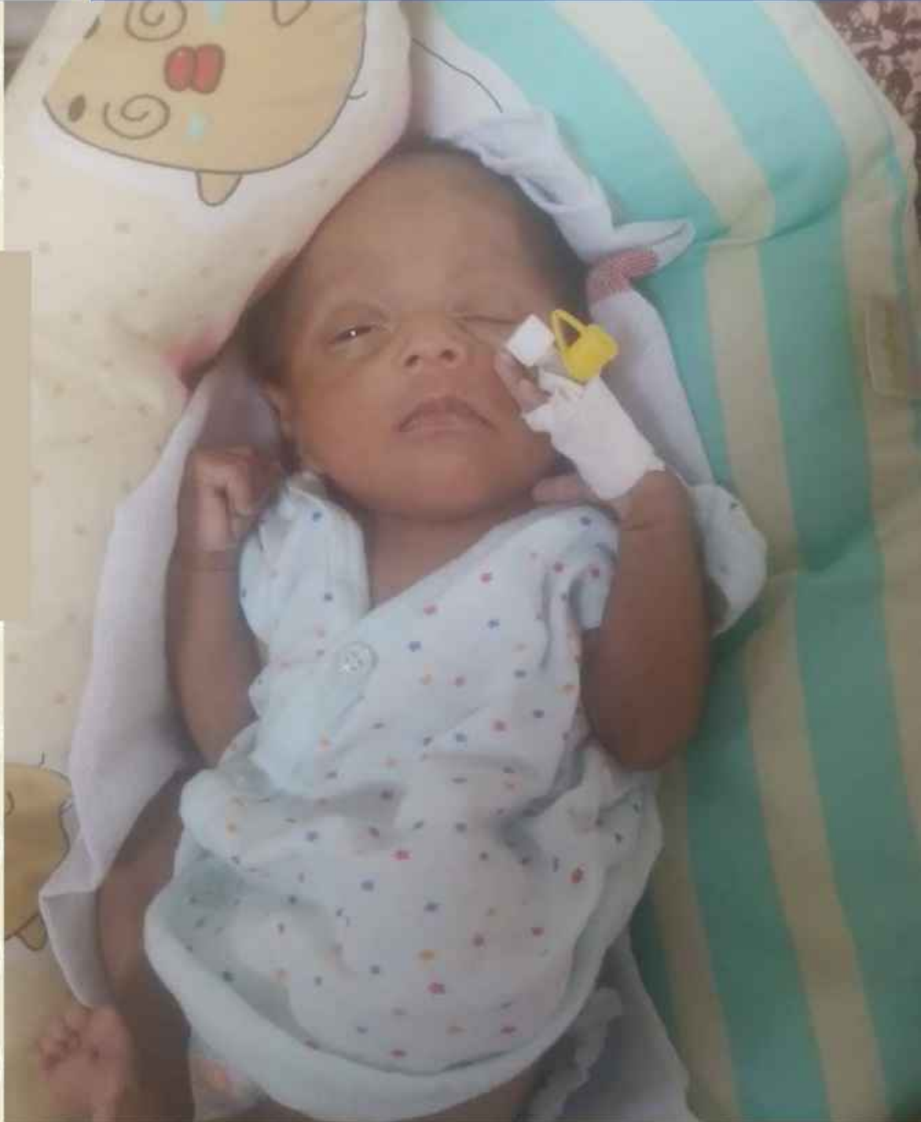
One of the Balanethra babies who underwent laser surgery at Radhatri Nethralaya, for RCCT's ongoing signature project.